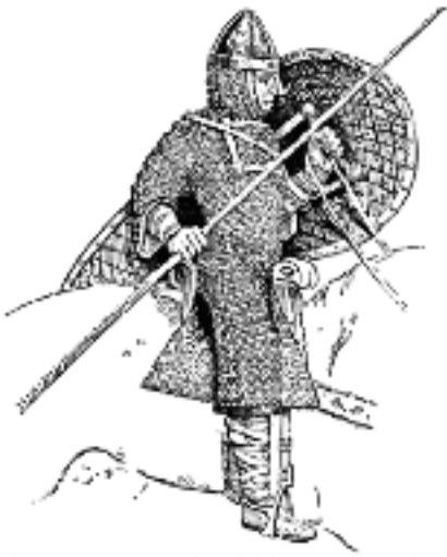
Figure 1. Imagine fungicide resistance being like a coat of armor, protecting the spore from the chemical poison.